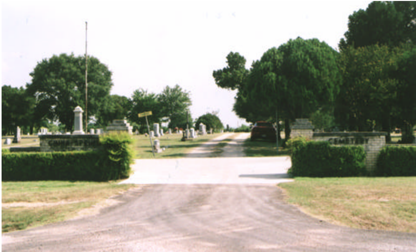
China Springs Cemetery, Old China Springs Road, China Springs, McLennan Co., TX