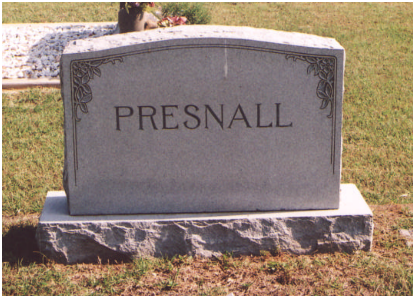
Presnall Plot Harris Street Section, China Springs Cemetery, McLennan Co., TX