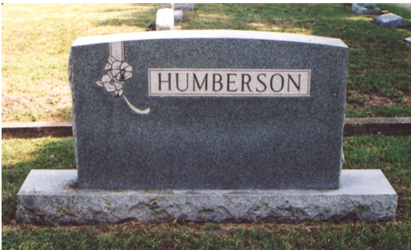
Humberson Plot Jay Street Section, China Springs Cemetery, McLennan Co., TX