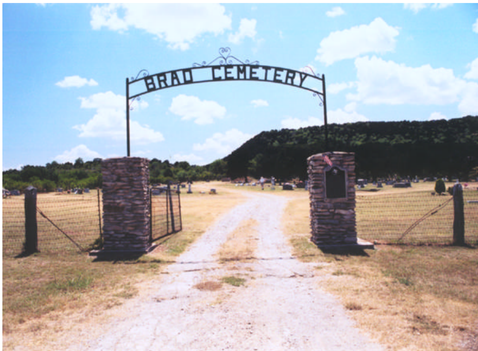
Brad Cemetery, Hwy 180, Brad, Palo Pinto Co., TX, 27 Jul 2003