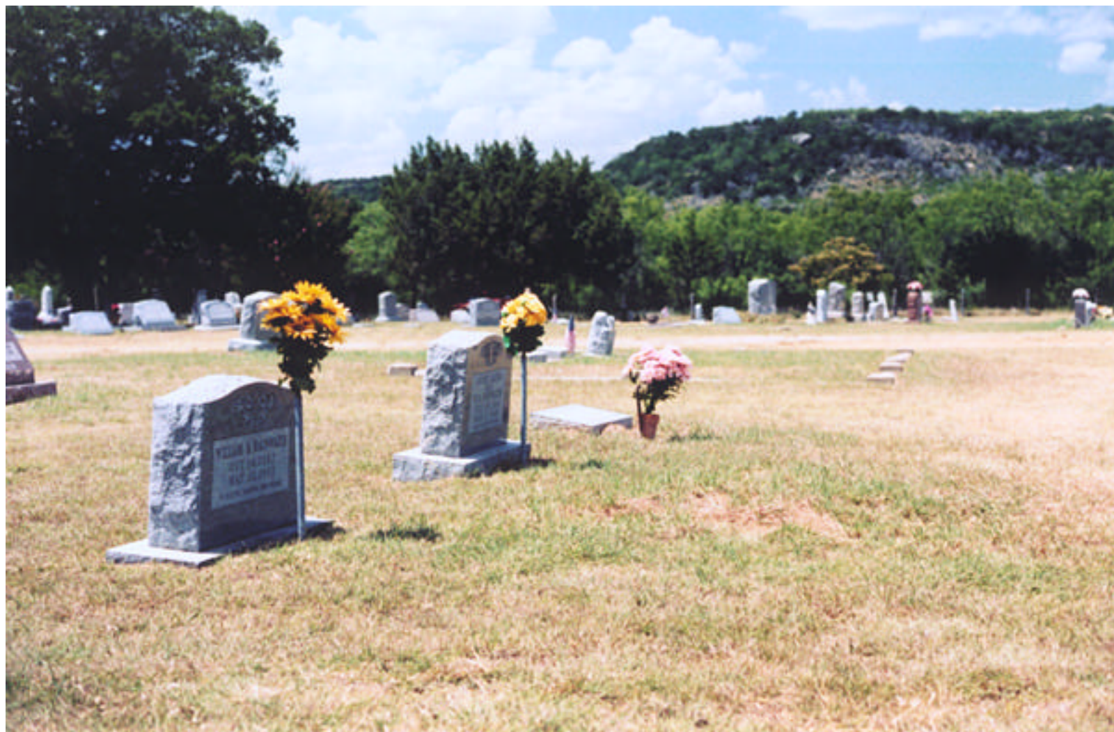
Rainwater graves in Brad Cm., Palo Pinto Co., TX, 27 Jul 2003