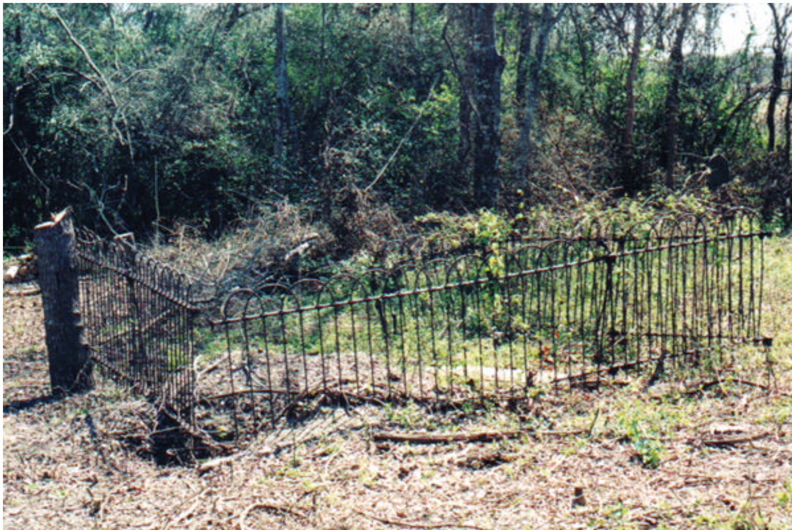
Rainwater enclosure towards rear of cemetery Brenham Masonic Cemetery, Old Masonic Road, Brenham, Washington Co., TX, 15 Mar 2003