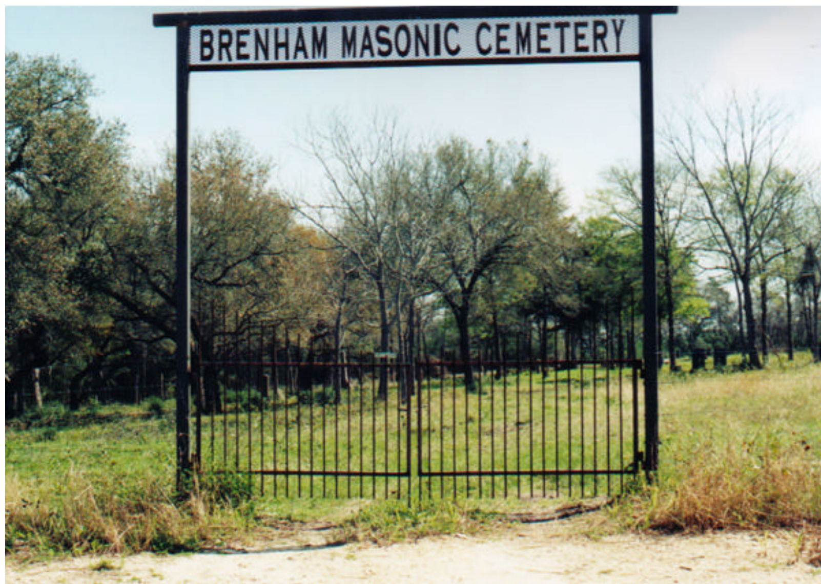
Brenham Masonic Cemetery, Old Masonic Road, Brenham, Washington Co., TX