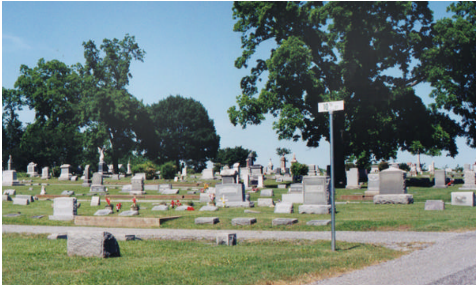
West Hill Cemetery, Sherman, Grayson Co., TX, 18 May 2002 Section bounded by 9th, 10th, A and B Streets