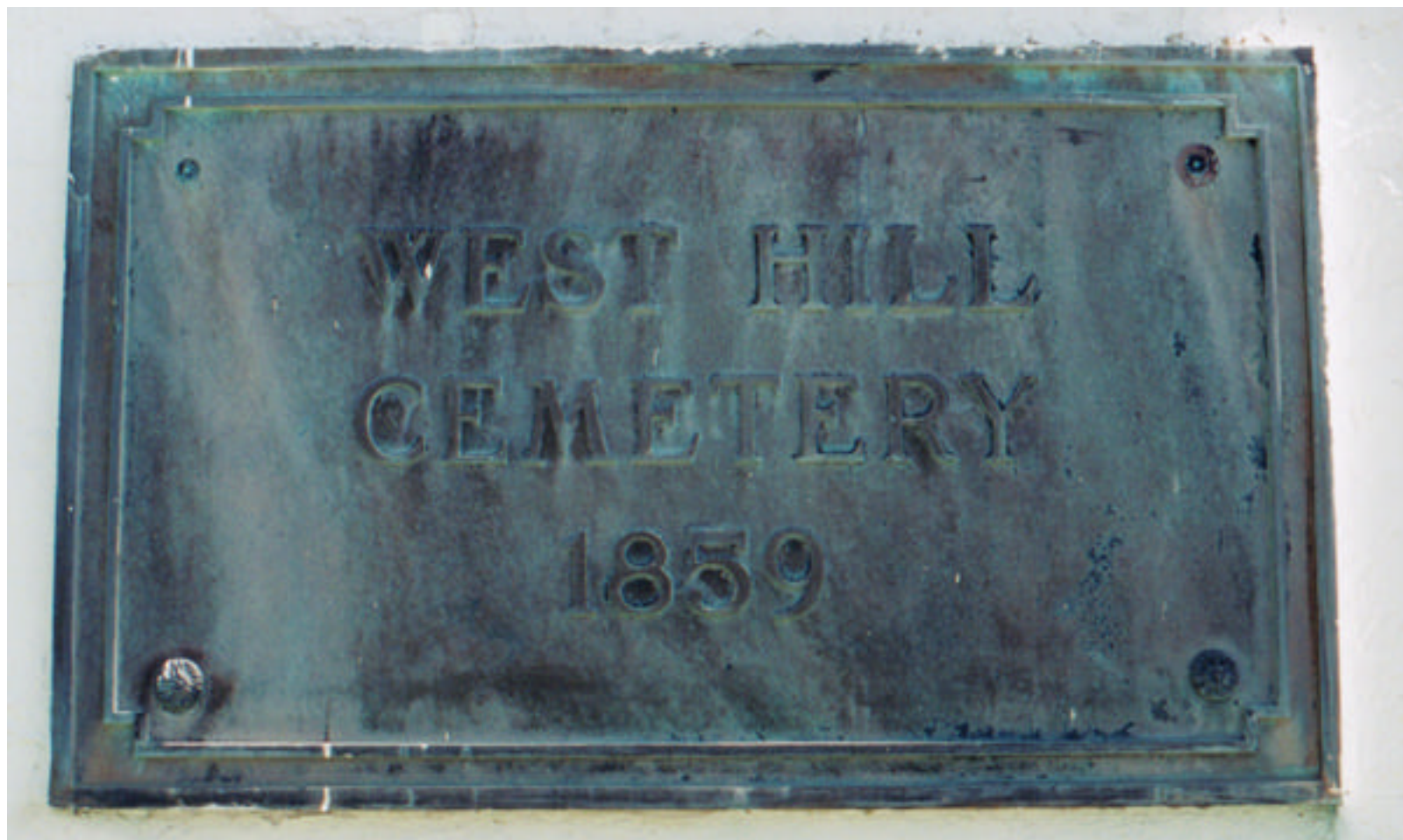
West Hill Cemetery, Lamar Street, Sherman, Grayson Co., TX, 18 May 2002