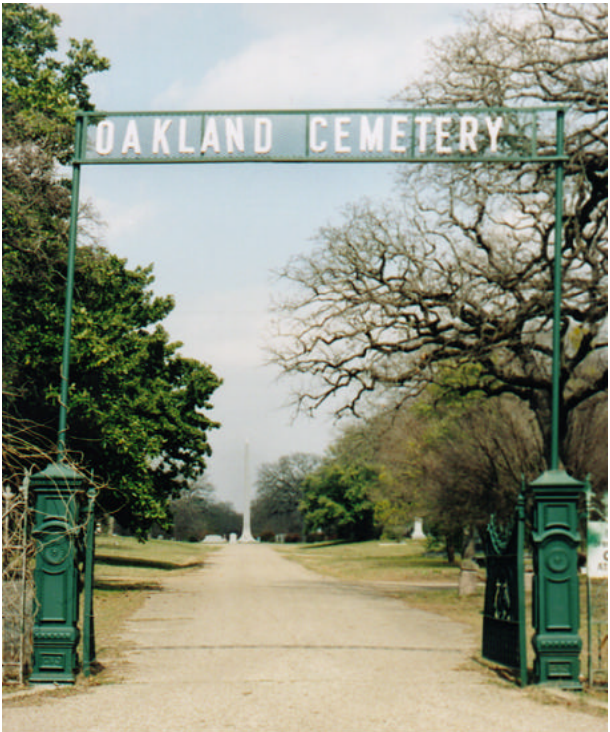
Oakland Cemetery, Malcolm X Blvd., Dallas, Dallas Co., TX