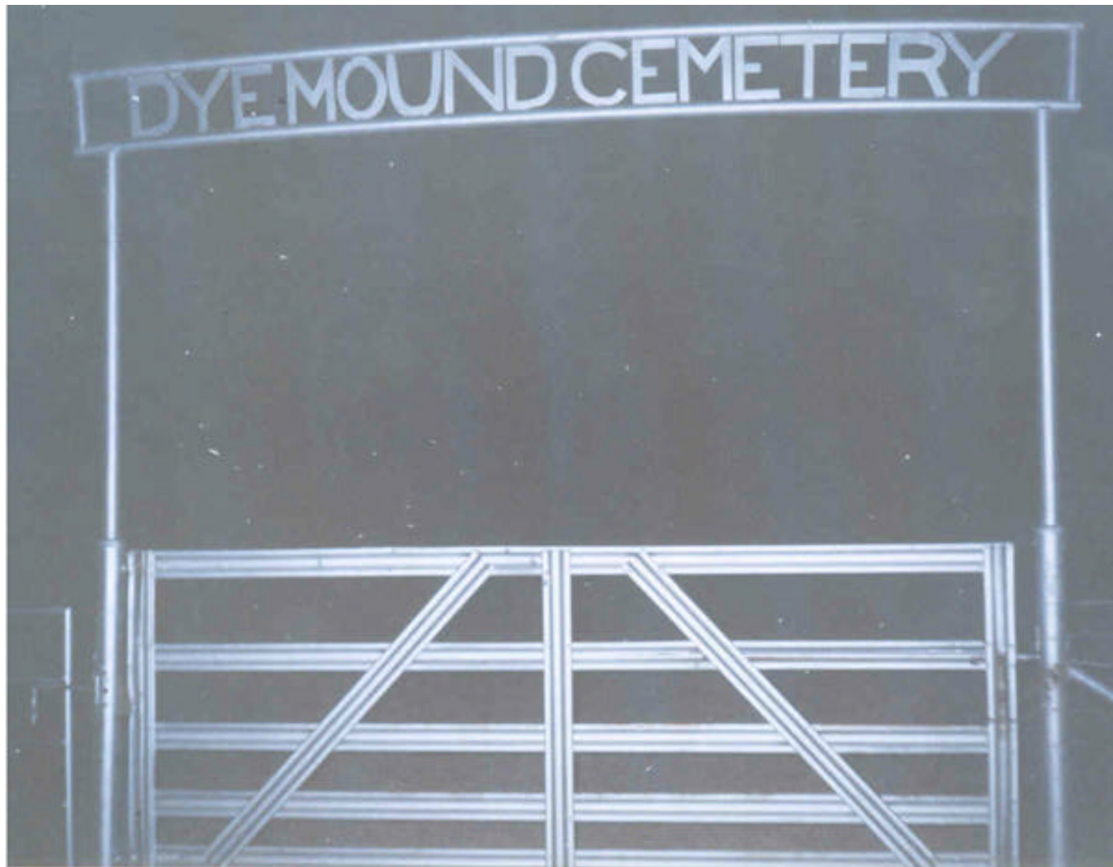
Dye Mound Cemetery, FM 677, Montague Co., TX