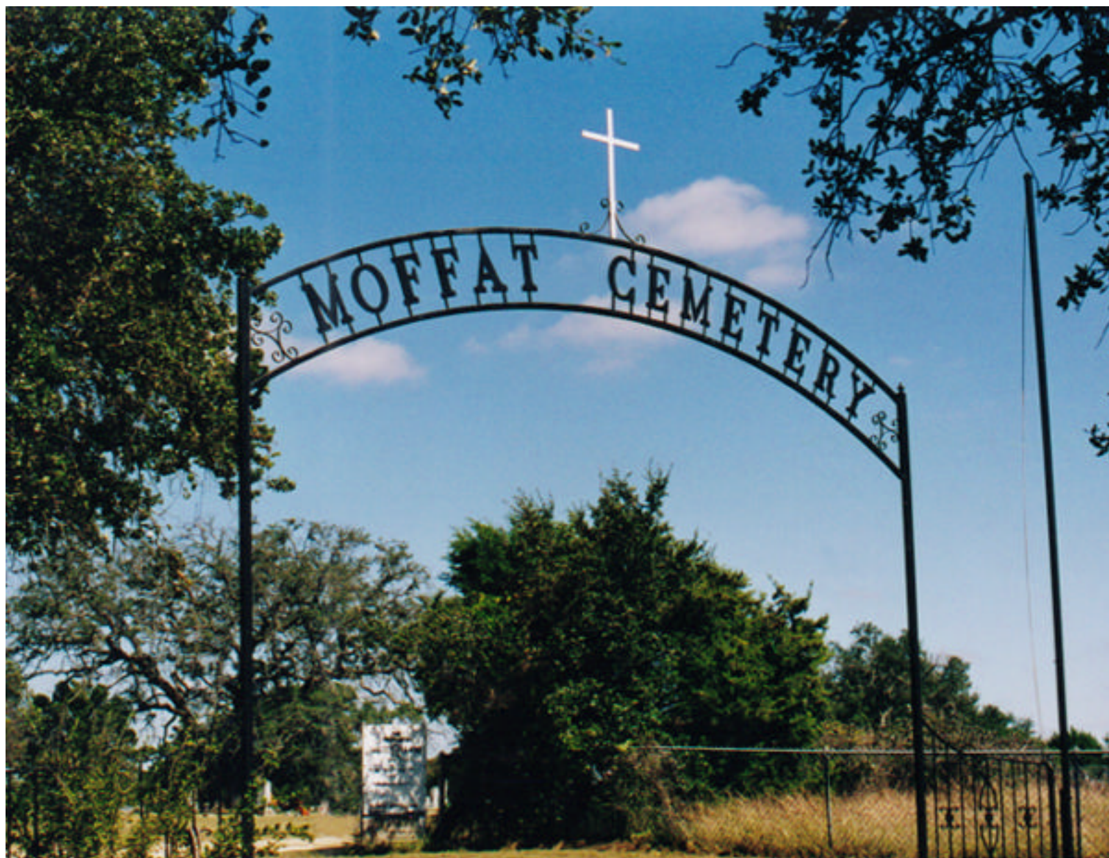
Moffat Cemetery, Hwy 36, Moffat, Bell Co., TX, 19 Oct 2001